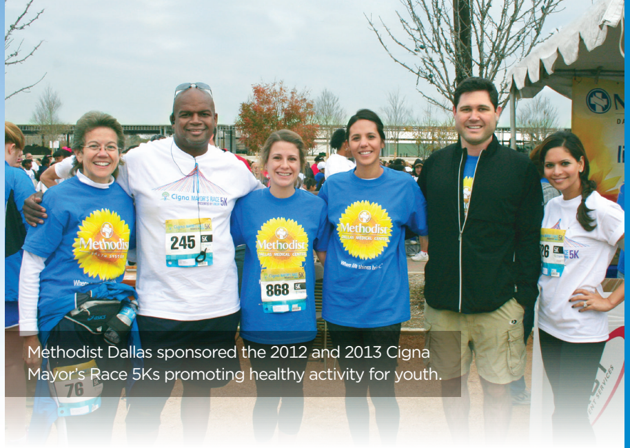
Methodist Dallas sponsored the 2012 and 2013 Cigna Mayor's Race 5Ks promoting healthy activity for youth.